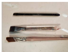
I use these to wash on color.

WASH BRUSHES: I use just three sizes: a medium flat (around 3/4"), and 1 inch flat brush and a larger 1.5 inch flat brush. Only occasionally do I need a smaller brush.